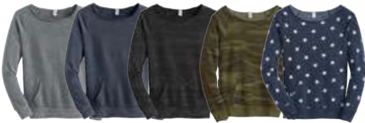
ECO GREY ECO TRUE NAVY ECO BLACK CAMO STARS