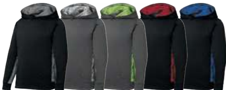
BLACK/ DARK SMOKE GREY