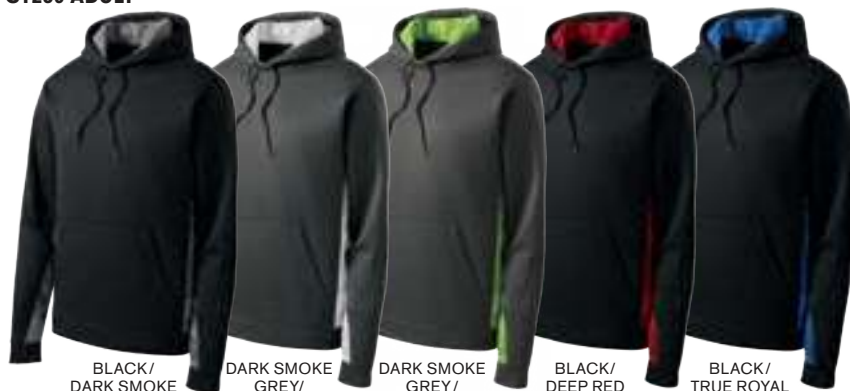
BLACK/ DARK SMOKE GREY