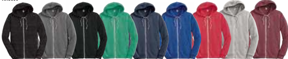
ECO BLACK ECO GREY ECO TRUE BLACK ECO TRUE GREEN ECO TRUE NAVY ECO TRUE PACIFIC BLUE ECO TRUE RED NEW! ECO OATMEAL GREY NEW! ECO TRUE CURRANT

Eco-Fleece infuses each garment with unique character. Please allow for slight color variations.