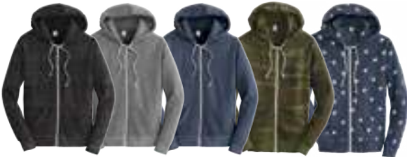
ECO BLACK ECO GREY ECO TRUE NAVY CAMO STARS