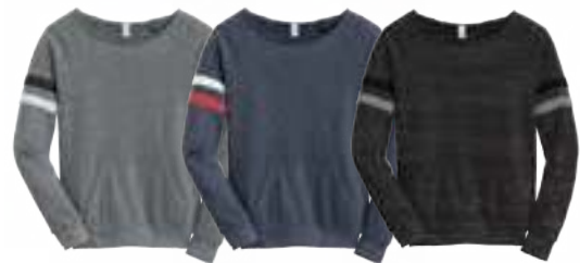
ECO GREY/ECO BLACK/ECO IVORY ECO TRUE NAVY/ECO IVORY/ECO TRUE RED ECO BLACK/ECO TRUE BLACK/ECO GREY